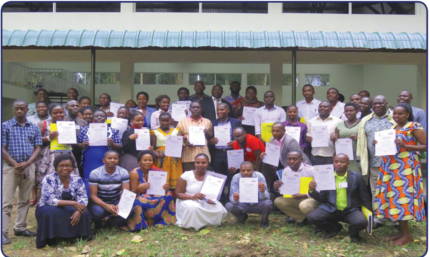
Health workers with their certificates after the training at Bwindi Community Hospital.

Health workers from health facilities neighboring Bwindi Community Hospital (BCH) in Kanungu district have been trained to enhance capacity for early detection and management of mental health problems in a Primary Health Care (PHC) network.